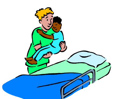
Even moving a child has the potential to injure if not done correctly.

"If you have an injury at work, you need to notify your manager immediately. You shouldn't wait 24 hours or until the next time you work. I know people who have let it slide and when something happened that compounded the original injury, there was no paperwork supporting the claim. You have to protect yourself by reporting the injury, signing up for the physician pre-designation form, and hiring an attorney, if necessary."